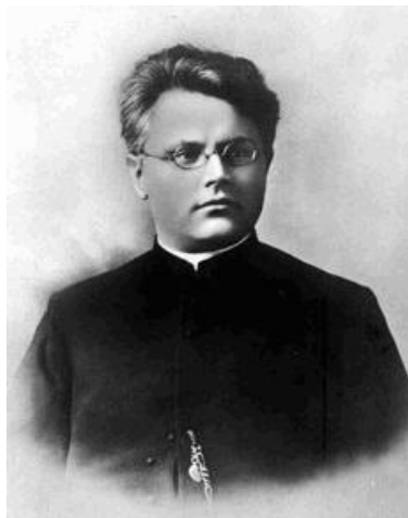
Juozas Tumas Vaižgantas

You will have 1-2 minutes to give your talk.